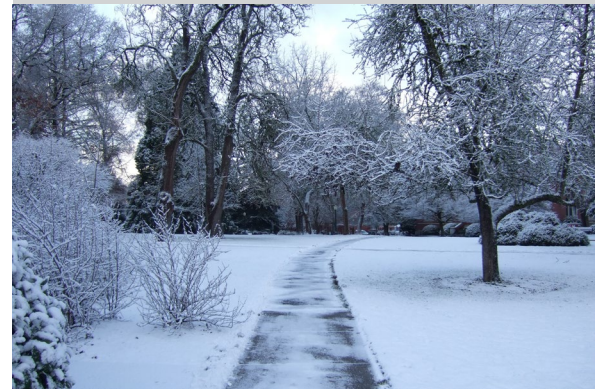
When outdoors, avoid hazardous areas such as tall trees, debris piles, or flooded areas.