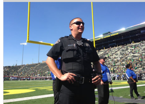
UOPD officer on duty at football game.