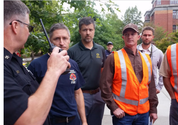
UO and city staff responding to a hazard.