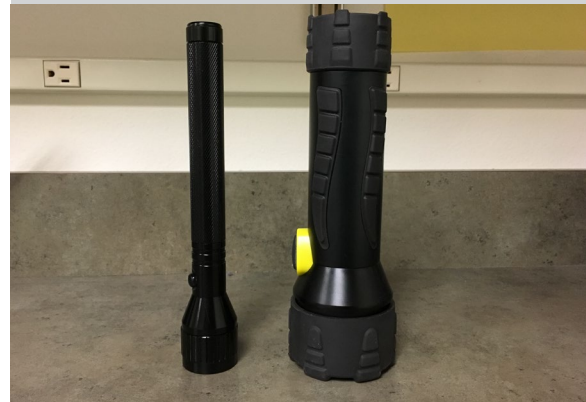
Do not use an open flame for light.