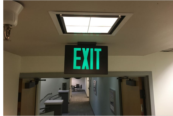
Evacuate, do not use elevators.