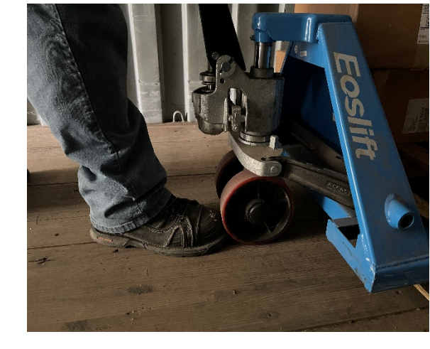
Wear the appropriate PPE