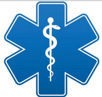
Stay with the victim until relieved by emergency responders, or the scene becomes unsafe.