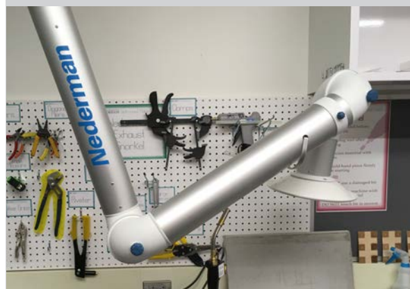
Utilize a fume hood or local exhaust to capture WAGs