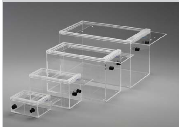
Example: Sliding lid chamber