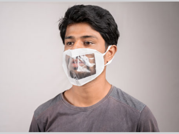
Mask with a clear plastic window help the hearing impaired read lips.