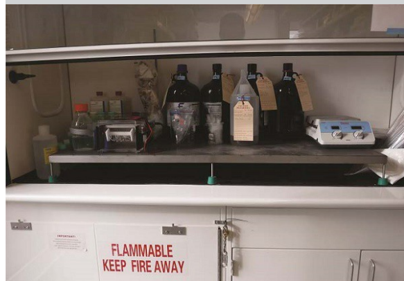
Place large equipment or stored items in the fume hood on a raised platform to allow air to be drawn into the rear baffles.