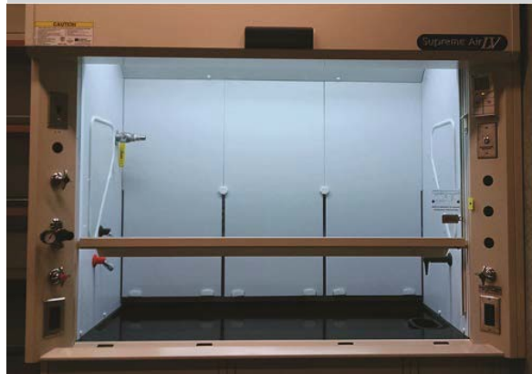
Keep fume hoods clear and minimize storage to provide adequate ventilation.