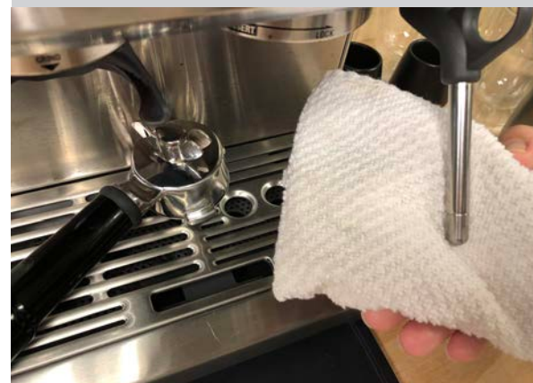
Keep hands out of the path of the espresso steam wand!