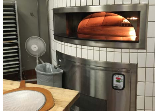
Pay attention to your surroundings and sources of heat!