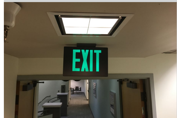
Evacuate the building and assemble at the designated location, do not use elevators.