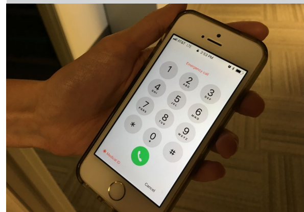
Call 911. Inform emergency personnel of any trapped or injured individuals.