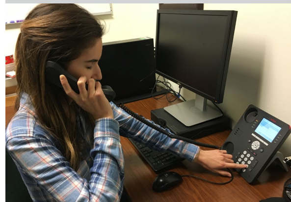
Call the UOPD at 541-346-2919