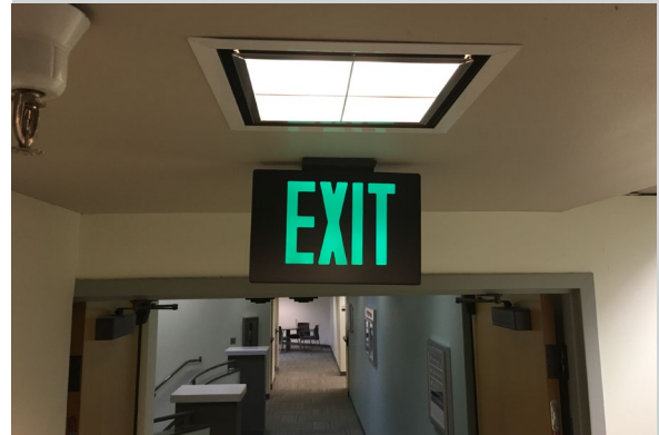
Evacuate the area around the object and keep others away.