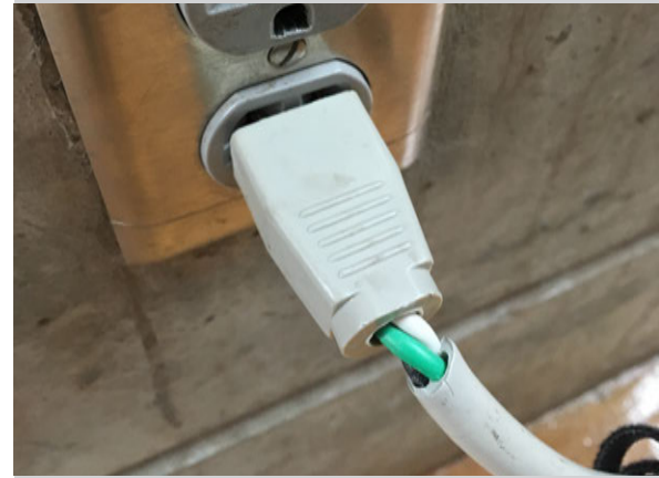
Learn to recognize all hazards!