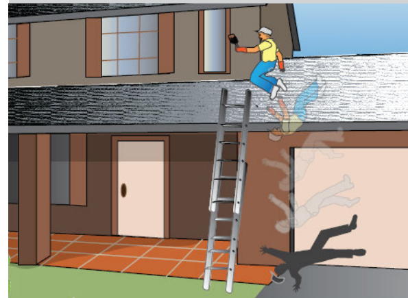
Report immediately if believed to be imminent danger!