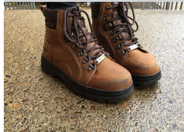
Use the right PPE for the task!