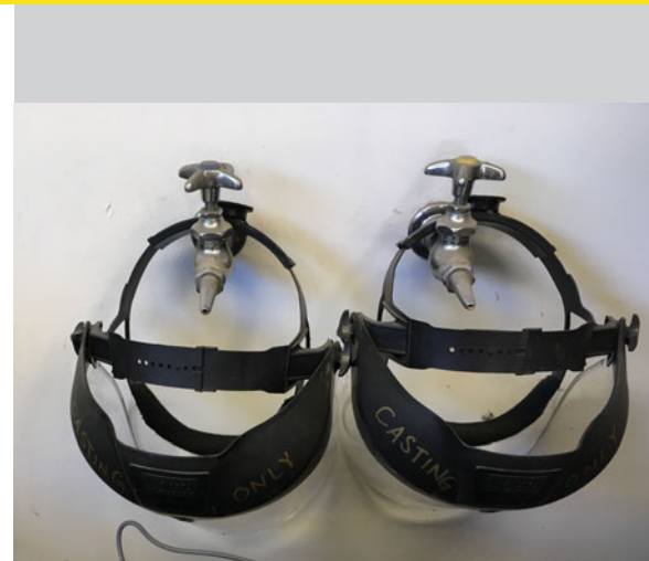
Always wear required PPE!