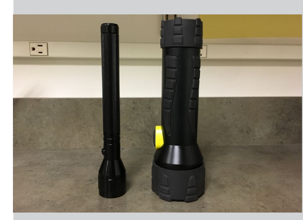
Do not use an open flame for light.