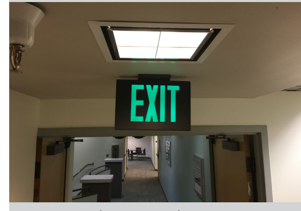
Evacuate, do not use elevators.