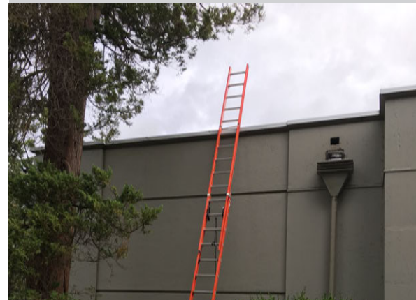
Do not step on the top three rungs of a extension or two of a self-supporting!