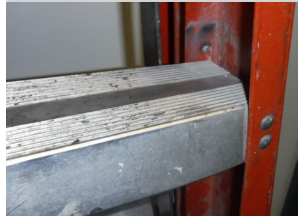
Do a pre-use inspection for wear!