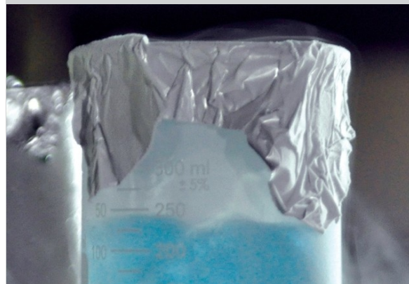
Dangerous liquid oxygen, note the electric blue color.