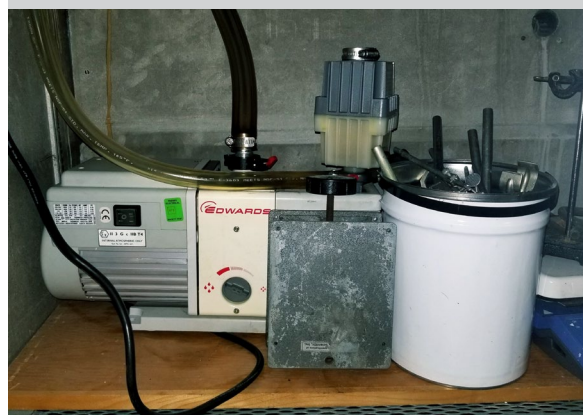
Example: Vacuum pump