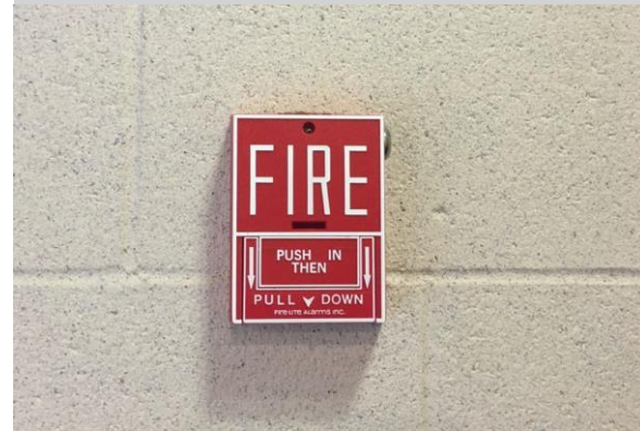
Activate fire alarm.