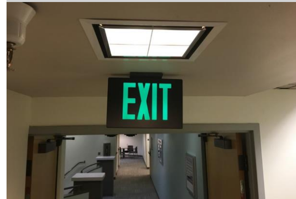
Evacuate the building and assemble at the designated location, do not use elevators.