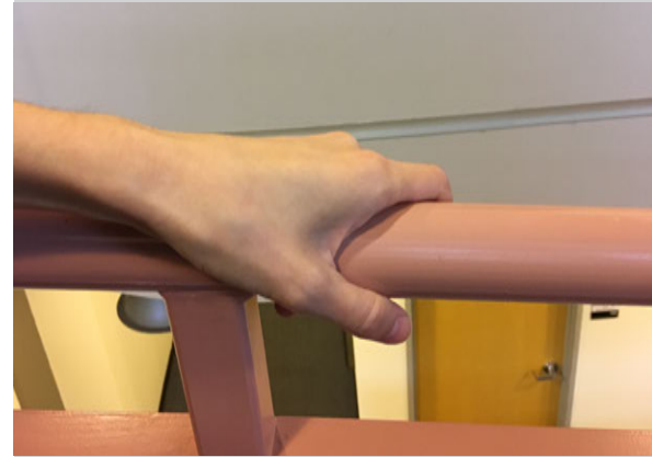
Pick a specific habit to practice!