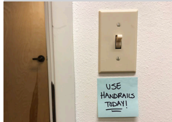
Set ways of reminding yourself to follow the new habit!