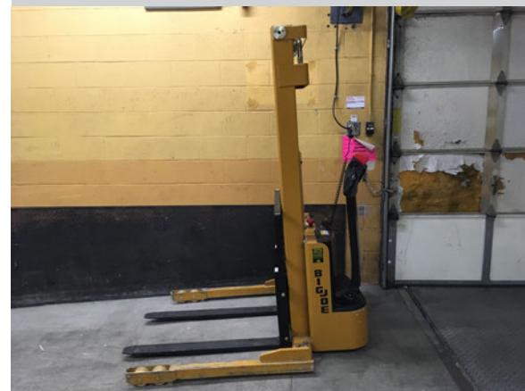
Receive training before the use of powered industrial trucks!