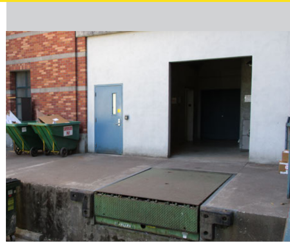
Use people doors (left) not rolling dock doors (right)!