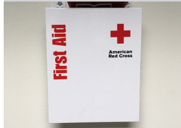
Know the location of the closest first aid kit.