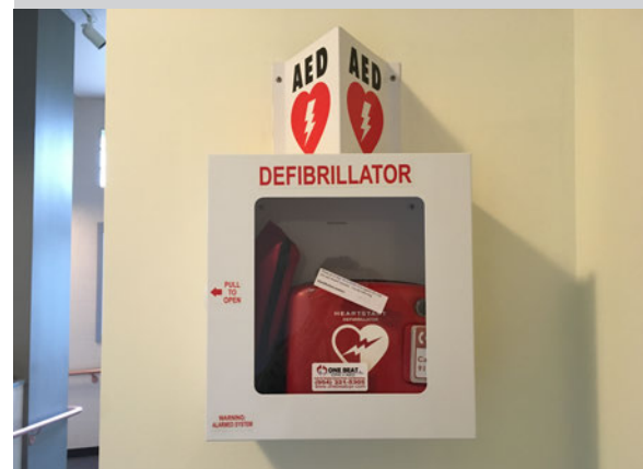
Know the location of the closest AED. Consult the UO AED map.