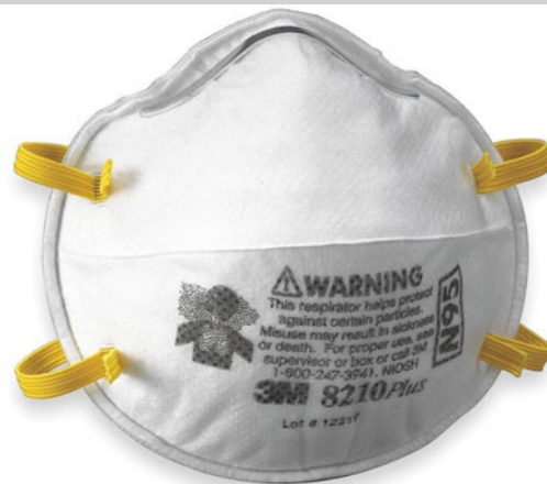
Example N95 respirator.