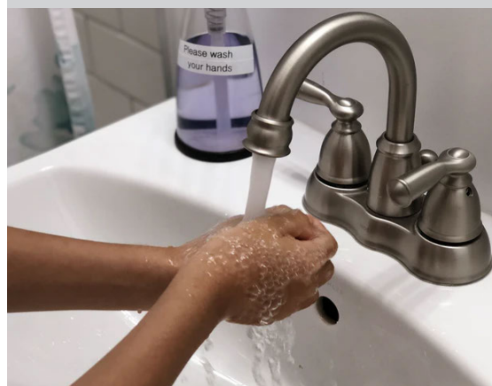
Wash your hands for 20 seconds before removing or putting on a N95.