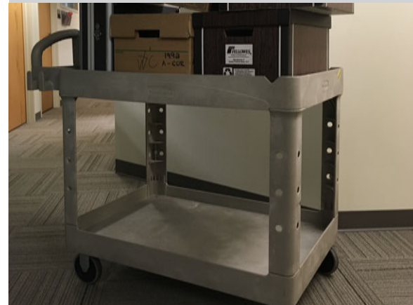
Pay attention to the distribution of weight when loading the cart!