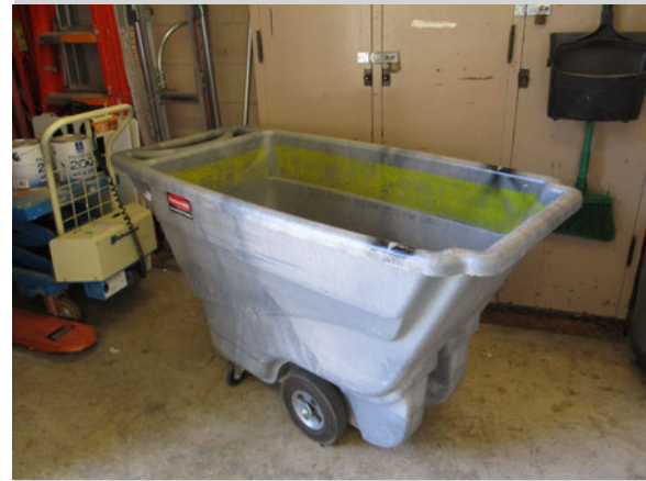
Pick the right cart for the task and load!