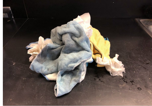
Safely dispose of all rags! Do not create a potential fire situation!