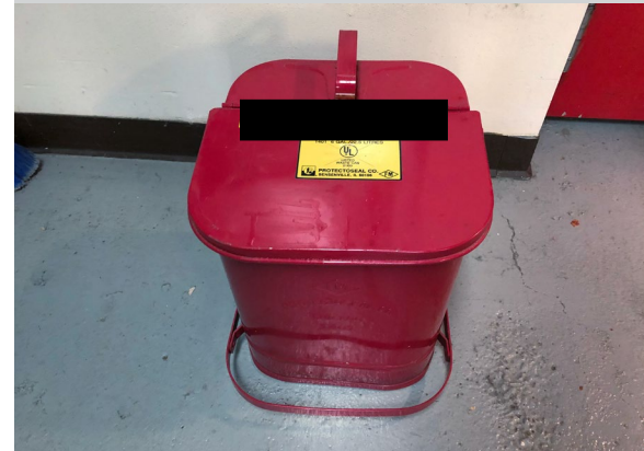
Place rags /towels wet with materials listed on the left in a sealed container or oil waste can (red or yellow)!