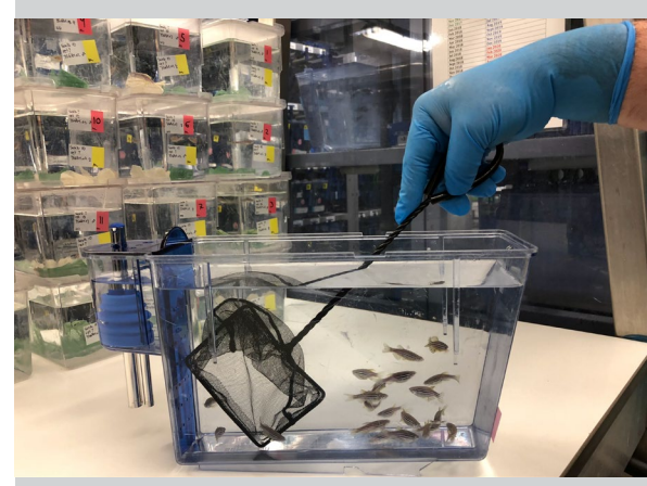
Wash your hands before leaving the facility!