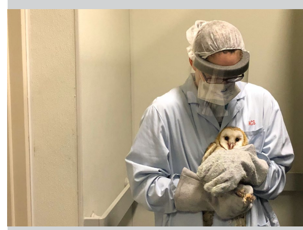
Wear required personal protective equipment!