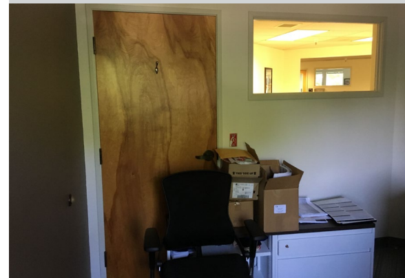
Hide - if running is not an option.