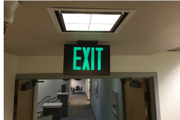
Run - evacuate if it is safe to do so.