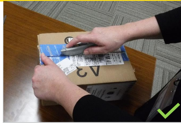
Cut at an angle away from your body, keep your thumb and other hand away from the blade, and use the proper tool for the job to prevent injuries