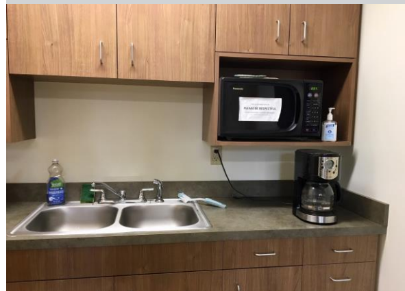
Kitchen appliances should be in designated break rooms!