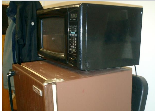
Kitchen appliances should not be in offices!