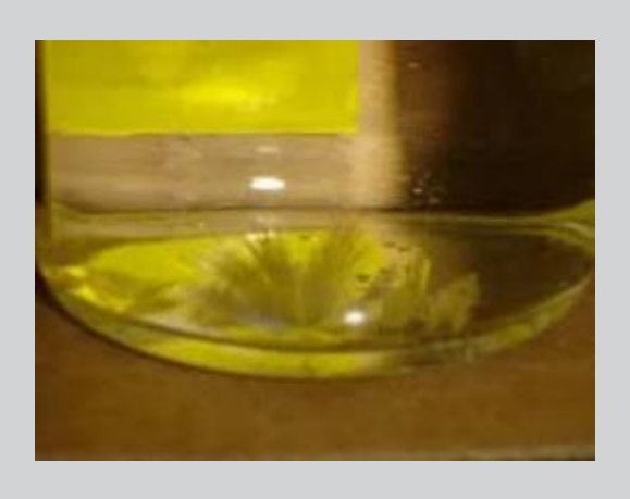
Example of Peroxide Formation