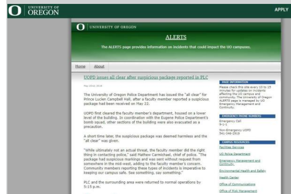
Check alerts.uoregon.edu for campus information.