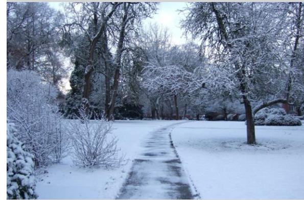
When outdoors, avoid hazardous areas such as tall trees, debris piles, or flooded areas.